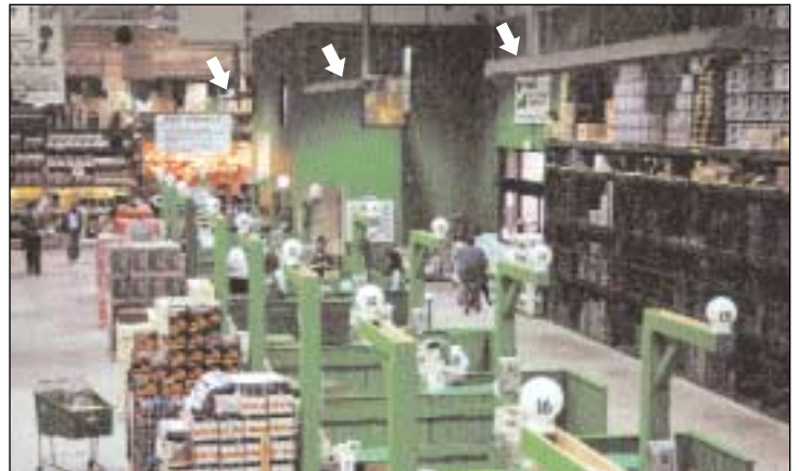
LTU Series infrared heaters installed at a Home Quarters retail store in Kansas City, Missouri.