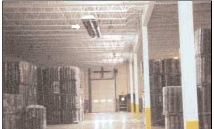
LTU Series infrared U-Tube heaters in a large warehouse facility in Chicago, Illinois.