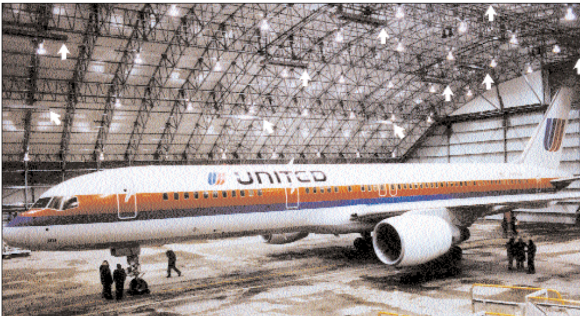
25 Space-Ray RSTP17 heaters installed at an aircraft maintenance hangar in Boston, Massachusetts.

For the name of your nearest Space-Ray representative, call 1-800-438-4936