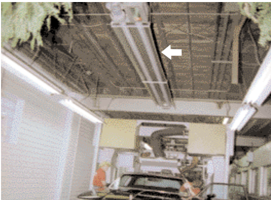
Car Wash dry area heated with LTU75