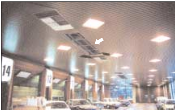
Eight RSTP Series heaters installed in a drive-in claim center at the Insurance Company of British Columbia in Vancouver, Canada. This is one of 34 locations heated by Space-Ray.