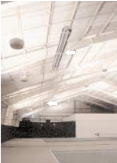
Indoor tennis court with 8 LTU75's installed 20' above baseline.