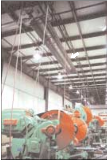
30 Space-Ray LTU175 infrared U-tube heaters with 175,000 Btu/hr capacity installed at a manufacturer of electrical components in Indiana.