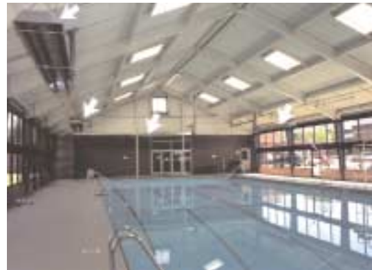
Gardner-Webb University pool area heated with 6 LTU80's