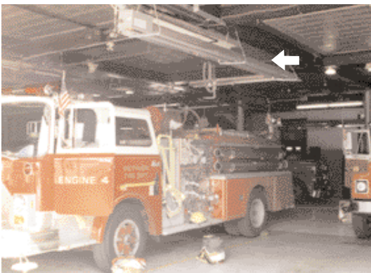
Fire station heated with 2 LTU60's mounted 12' above finished floor.