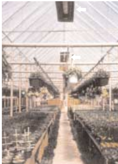
Virginia Polytechnic Research greenhouse, heated with 6 LTU100's.