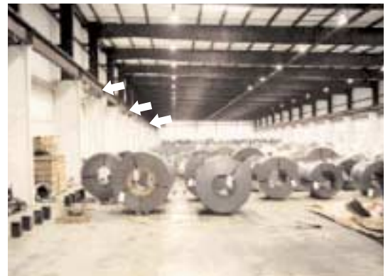
Steel storage warehouse condensation control and heating system using 28 LTU75's mounted 25' above finished floor.